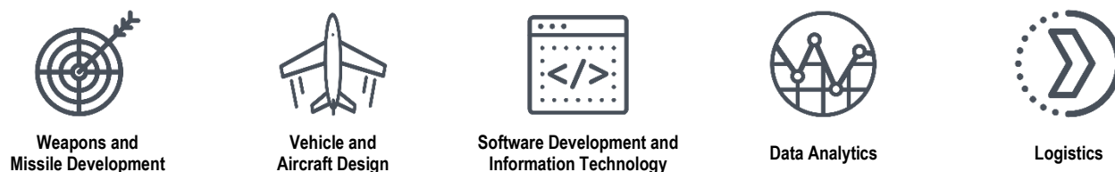
Figure 1. Targeted Industries